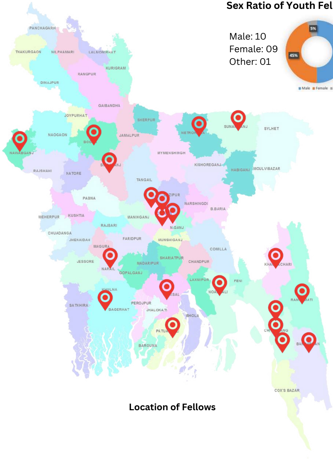
Location of Fellows