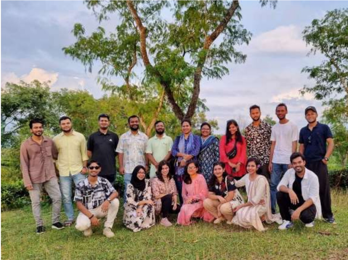
Figure: The CAP-RES team