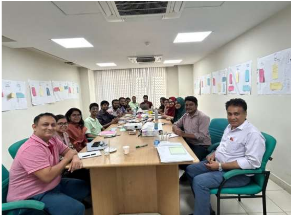
Fig: Quarterly Meeting