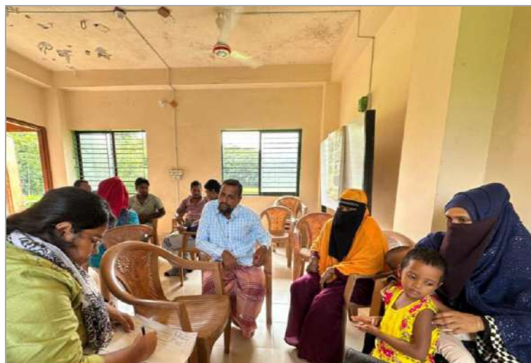
Figure 2 Interaction with the Village Community Group (VCG) members

After the field visit, I had to fill in the cleaned data and that led me to data management for the work.